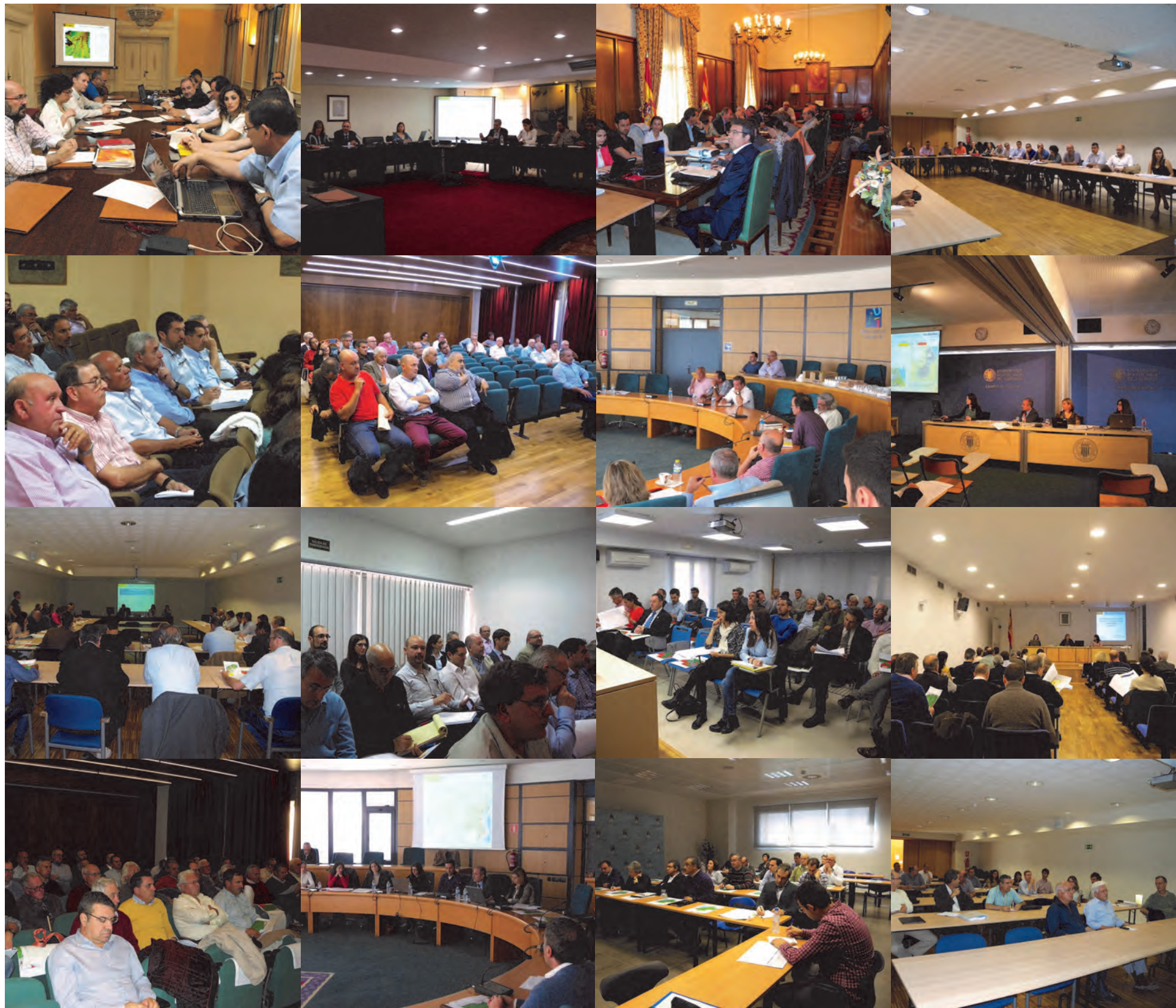
Image: Territorial meetings in different locations of the District

In the meetings held during the public consultation process of the River Basin Management Plan, the existing issues associated with the status of surface and groundwater bodies and the possible measures to take to achieve the environmental objectives have been discussed for each of the different territories. For this purpose, a dossier with cartographical material and information charts regarding the status of surface and groundwater bodies, detected non-compliance, existing pressure and a measure proposal was provided in every meeting. All this material was explained by experts of the Hydrological Planning Office and the attendees were simultaneously encouraged to make the contributions and comments they deemed appropriate.